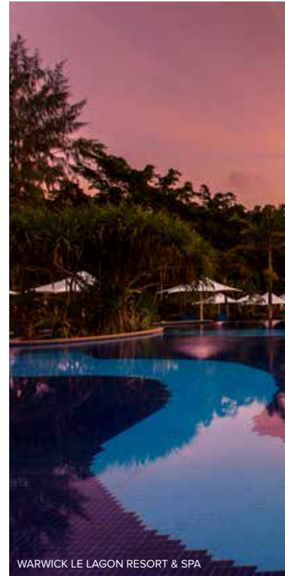
WARWICK LE LAGON RESORT & SPA