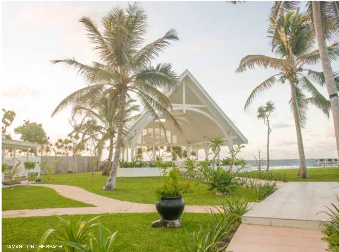
TAMANU ON THE BEACH