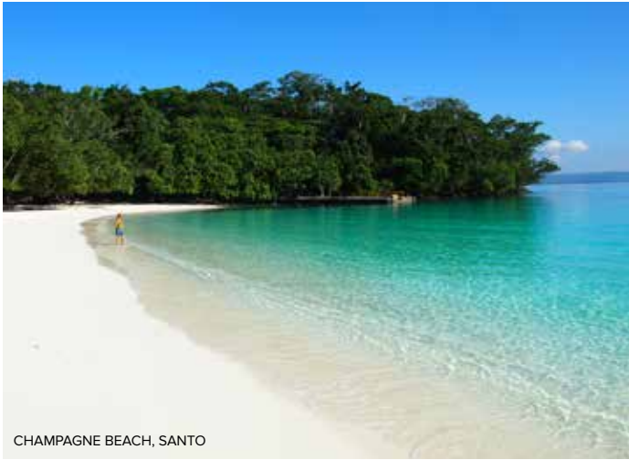
CHAMPAGNE BEACH, SANTO