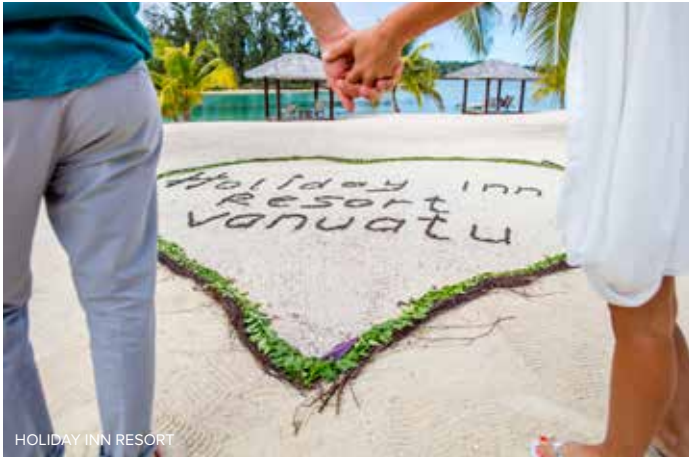
HOLIDAY INN RESORT