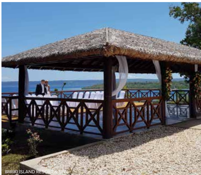
IRIRIKI ISLAND RESORT & SPA